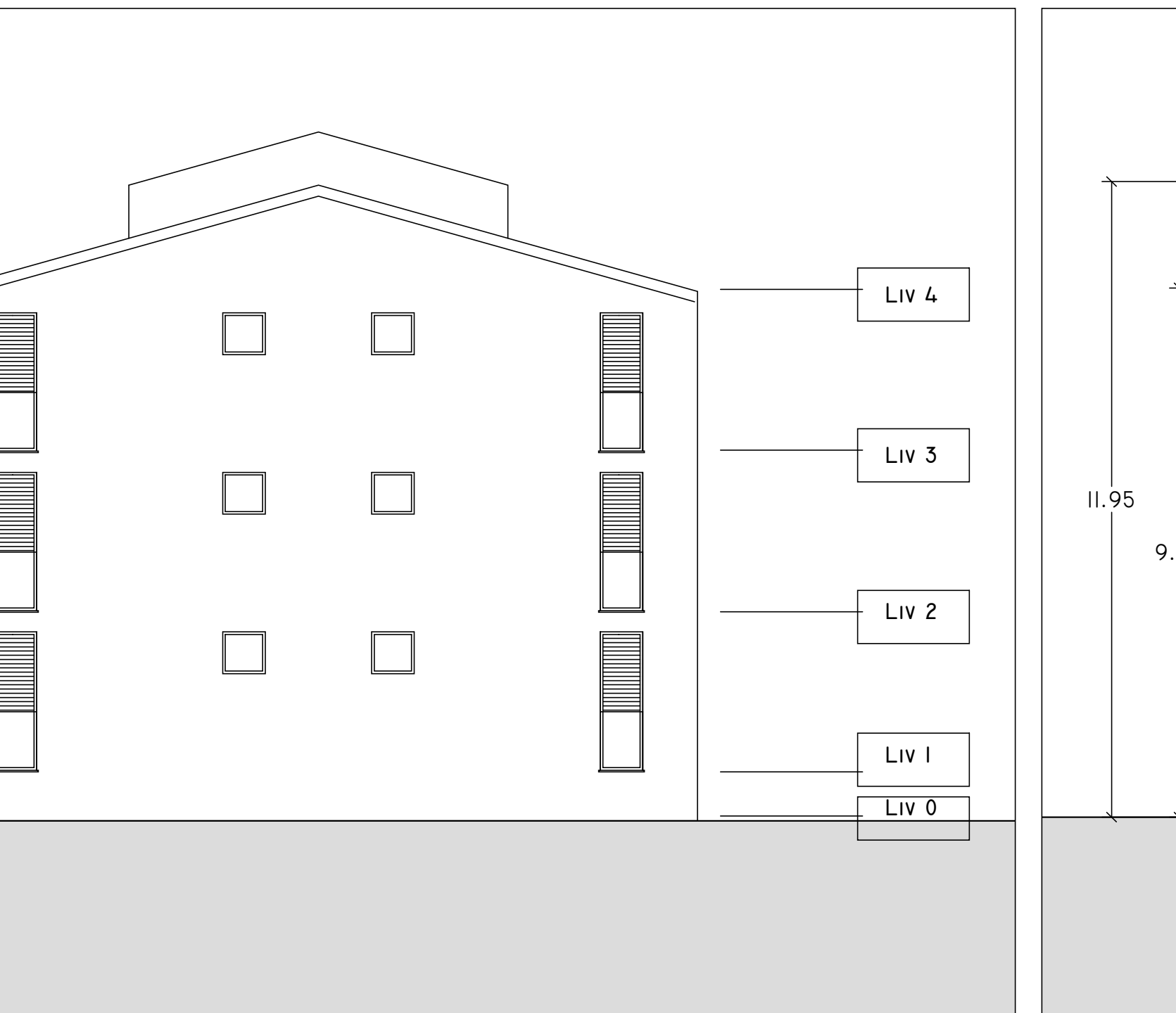
SUD 1 : 100