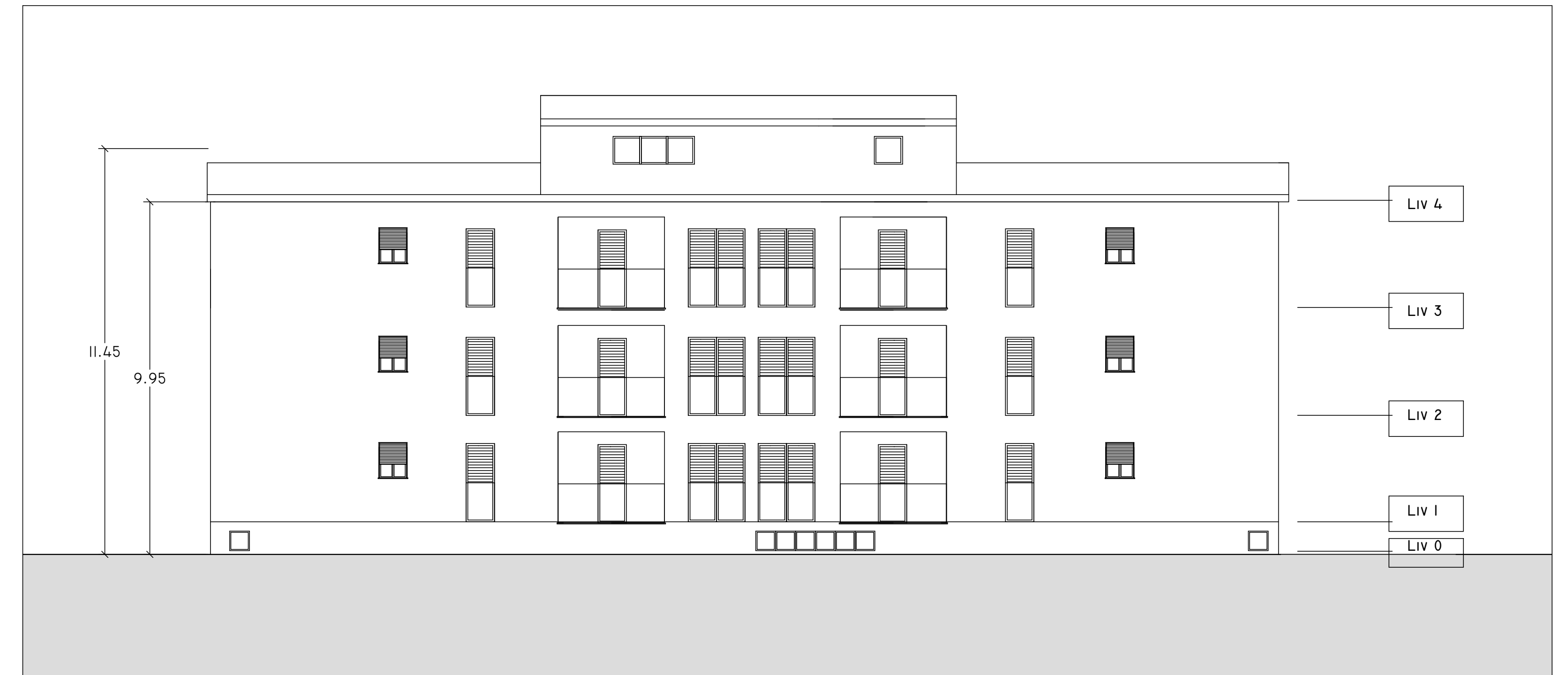
EST 1 : 100