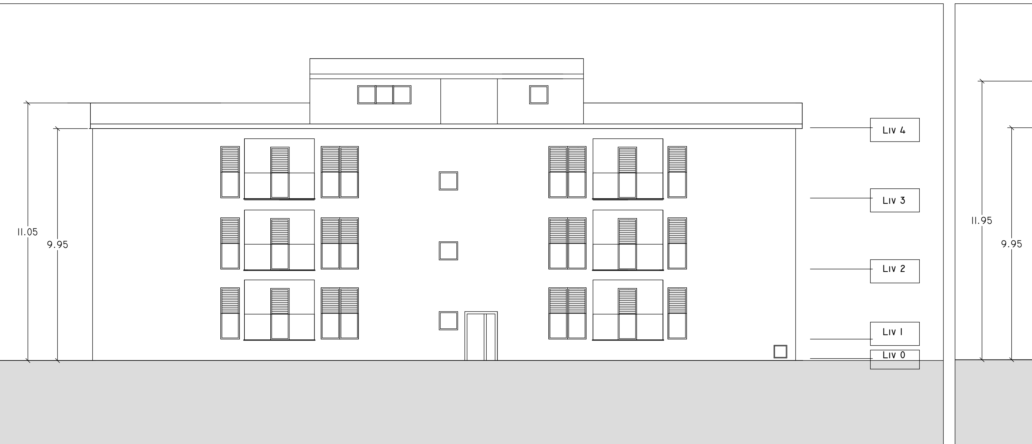
OVEST 1 : 100